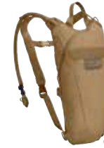
NIR 1717201000 COYOTE