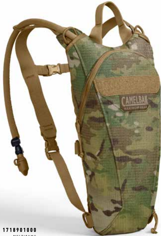
NIR 1718901000 MULTICAM®