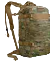
NIR 1735901000 MULTICAM®