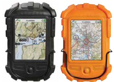
Black Silicon Rubber Case