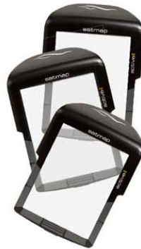
Active 10 Screen Cover